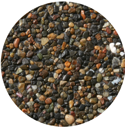
Black EM94820009 10 Units/Case

Available as liquid colorants or dry pigment packs, count on Mesa to deliver an exquisite appearance with long-lasting performance every time.