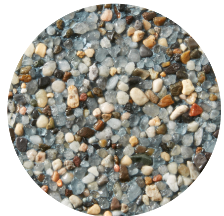
Caribbean EM53820027 15 Units/Case