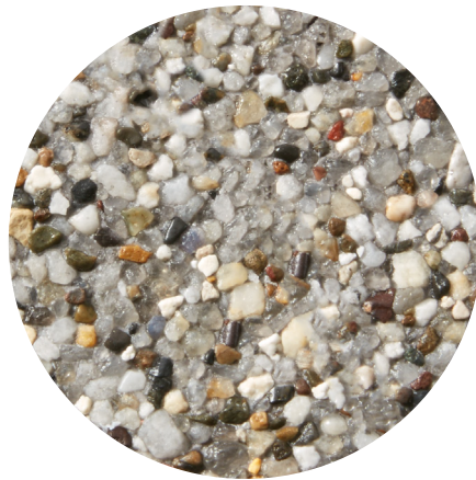
French Gray EM73820004 20 Units/Case