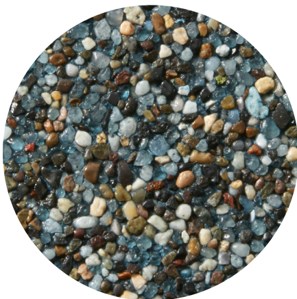
Midnight EM54820025 5 Units/Case