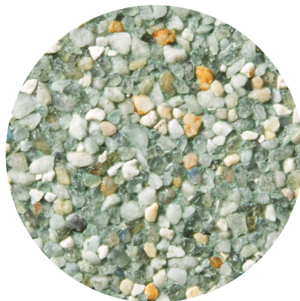
Jade EM62820015 5 Units/Case