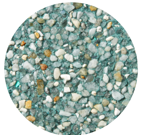
Irish EM62820014 10 Units/Case

Colors also available in liquid form. Contact your Mesa representative for details.