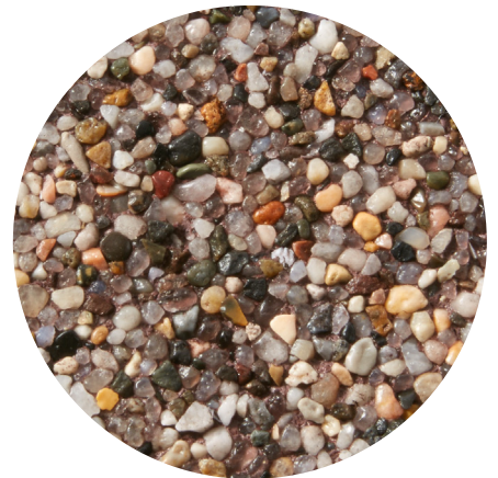
Mauve EM43820003 5 Units/Case