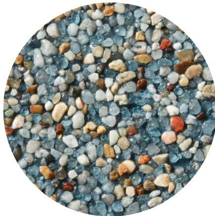
Tahoe EM54820023 10 Units/Case