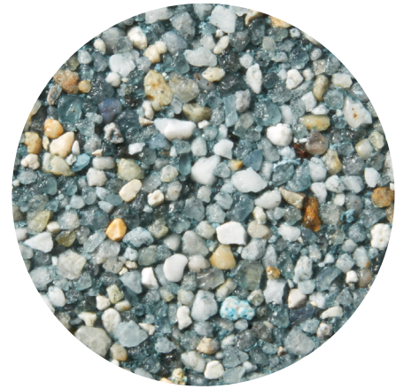
Tropical EM53820024 5 Units/Case