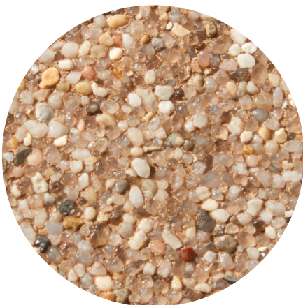
Sand EM82820004 5 Units/Case