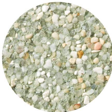
Emerald EM54820085 5 Units/Case